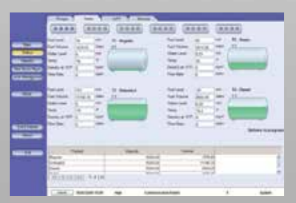
Real Time Tank Level