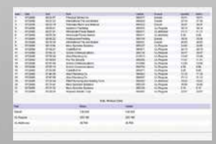
Real Time Reporting