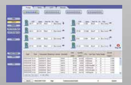
Real Time Fueling

Users can transfer the report in CSV, text or XML. They can set the delimiter, the decimal point notation and column names. The format column enables users to define specific formats, such as: date and time, left justification and zero padding for numbers. The reports can run manually or automatically. If they run automatically, the storage location is either FTP or Local Directory.