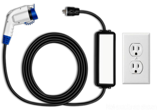
Figure 4- Typical 120 volt plug with an electric vehicle charging adapter. This is considered a Level 1 charger.

Level 3 chargers, otherwise known as Direct Current Fast Chargers (DCFC) are the fastest charging option for EVs and make long-distance travel easier. This charge option allows EVs to be topped up to 80% battery life in as little as half an hour. This type of charger utilizes the CHAdeMO and CCS (combined charging system) plugs. The capabilities of both EVs and DCFCs are continuously improving and causing charging wait times to decrease. The power output of level 3 chargers is typically 50 kW but can be as high as 150 kW or higher with proprietary charging systems like Tesla's supercharger network.