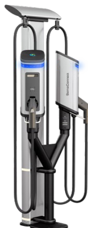
Figure 5 - A 240-volt Level 2 charging station can be installed at home or at work to charge an electric vehicle.