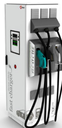
Figure 6 – Level 3 charging station is the fastest method of charging an electric vehicle.