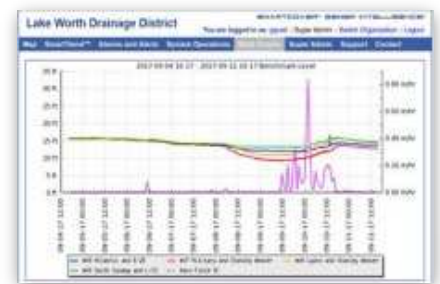
LWDD's Data during Hurricane Irma