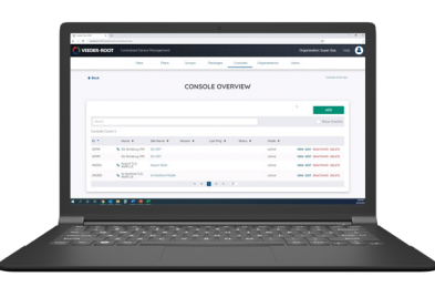
Centralized Device Management (CDM) A server-based software package supporting remote upgrades, backups, snapshot captures, and change management for the TLS4 Series ATGs.

The Web-Enabled Interface provides browser-based access to the ATG.