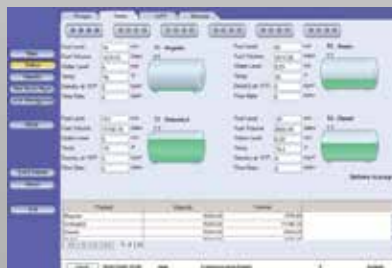
Real Time Tank Level