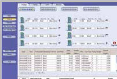
Real Time Fueling

Users can transfer the report in CSV, text or XML. They can set the delimiter, the decimal point notation and column names. The format column enables users to define specific formats, such as: date and time, left justification and zero padding for numbers. The reports can run manually or automatically. If they run automatically, the storage location is either FTP or Local Directory.