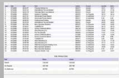
Real Time Reporting